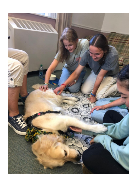
Everyone LOVED getting to spend time today with MacKinley, the therapy dog, from Monadnock Therapy Pets earlier this month!