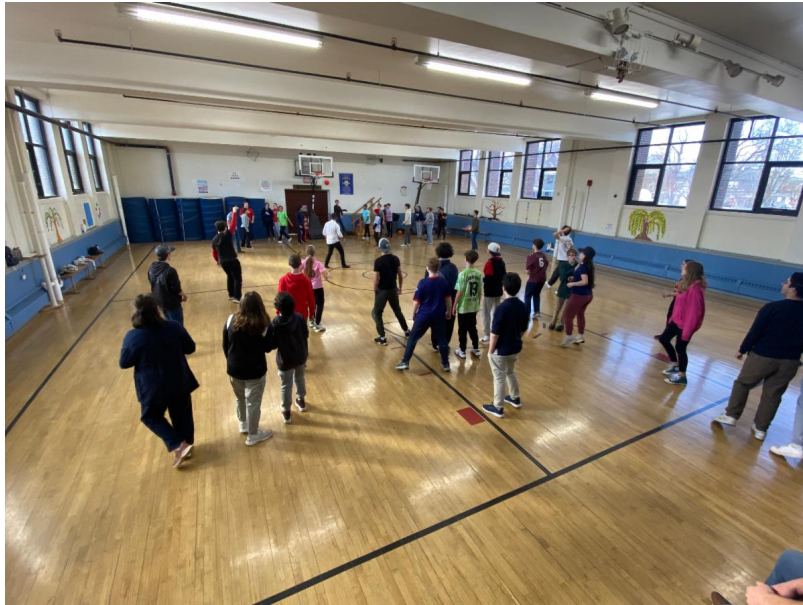
The juniors played Nation Ball against the 8th graders during Catholic Schools Week!